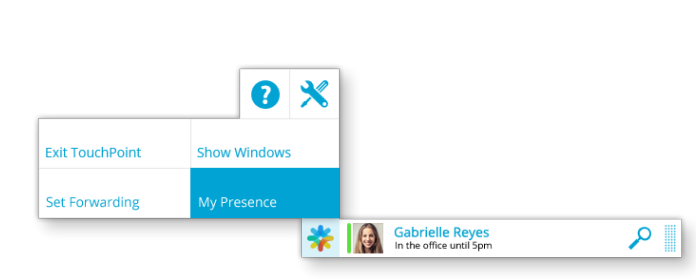
TouchPoint Call Bar

Ensure every customer receives the same level of service regardless of whether they choose to contact you by phone, email, web chat, SMS, social media or video. Using the highly visual and industry-leading TouchPoint interface, agents can handle multiple interactions at once, and even seamlessly escalate across contact channels for greater resolution or deal closing, e.g. from web chat to voice. CCE's omni-channel queuing lets you route, manage and measure all types of contacts using a single integrated workflow engine.